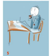
5 Administrational data processing & coffee-time ;)